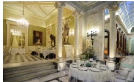
Casino's indoor area