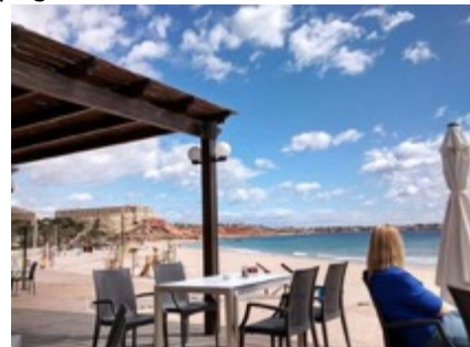
Montepiedra Playa Restaurant (Farewell Party)

On Saturday 14, we will take the bus to Campoamor beach (45 minutes) where we will be meeting at Montepiedra Playa Restaurant, located right by the beach sand to enjoy typical dinner and a get-together party with live music. Buses will take us back to Murcia but for those of you who prefer to spend the night in Campoamor and enjoy the beach please visit the option at the hotels page.