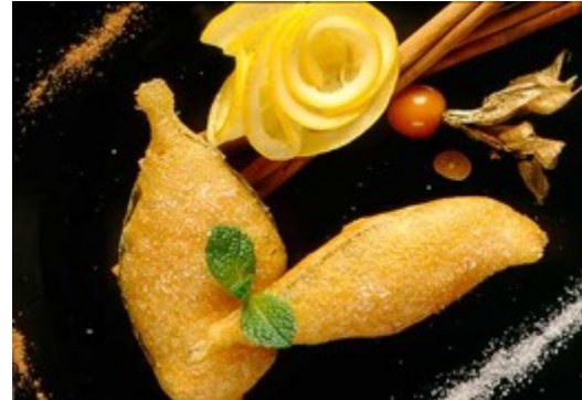
"Paparajotes", traditional Murcian sweet.

Some of our traditional dishes from "la huerta" (orchard) include Paparajotes, a typical Murcian sweet treat, made with lemon leaves.